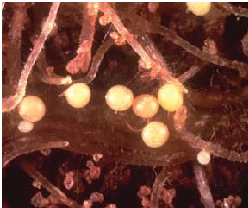
Figure 1. Swollen females of the white potato cyst nematode ( G.pallida ) on potato roots (x10)