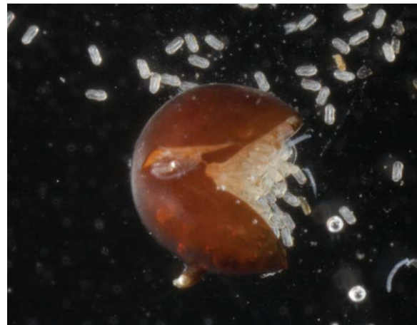
Figure 3. A Potato Cyst Nematode containing viable eggs and 2nd stage juveniles